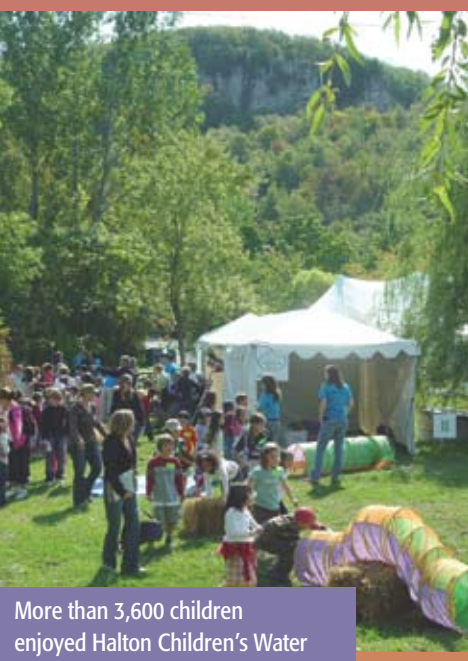
More than 3,600 children enjoyed Halton Children's Water Festival, Sept. 23-26 at Kelso Conservation Area, Milton, with the Escarpment as background.